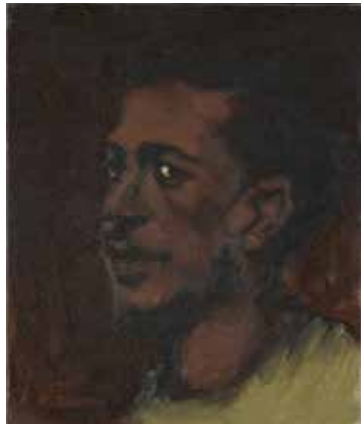
Lynette Yiadom-Boakye Non Loin d'Ici , 2010 Oil on canvas, 13 ⅜ x 11 ½ in.