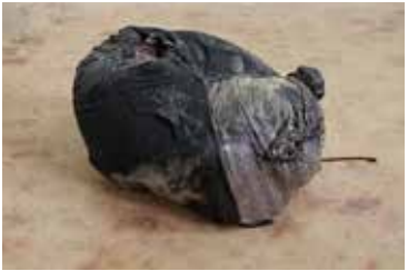
Kevin Beasley Wrong , 2013 Resin, body pillows, T-shirt, and hooded sweatshirt, 30 × 25 × 20 in.