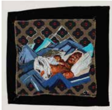
Chiffon Thomas A New Dad , 2017 Embroidery thread and fabric 11 ½ x 12 in.