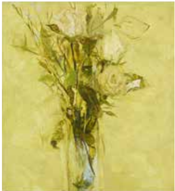
Jennifer Packer Untitled , 2014 Oil on canvas 11 x 12 in.