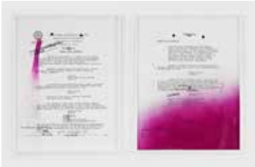
Sadie Barnette Untitled (People's World) , 2018 Archival pigment prints on Epson Hot Press Bright paper Two parts: 27½ × 21¼ in. each