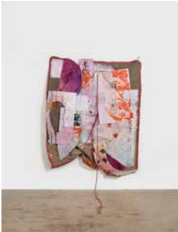
Eric N. Mack Pain After Heat , 2014 Acrylic spray paint on palm husk, cotton, microfiber blanket, moving blanket remains, thread, and a dried orange slice, 93 x 66 x 84 in.