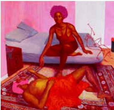
Arcmanoro Niles The Nights I Don't Remember, The Nights I Can't Forget , 2018 Oil, acrylic, and glitter on canvas 72 x 70 in.