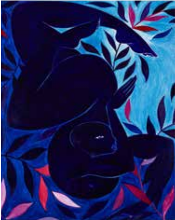
Tunji Adeniyi-Jones Blue Dancer , 2017 Oil on canvas, 68 × 54 in.