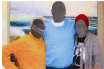
Sable Elyse Smith 8032 Days , 2018 Digital c-print, suede, artist's frame 48 x 40 in.