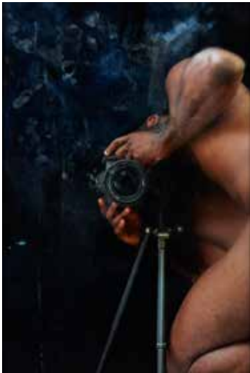
Paul Mpagi Sepuya Dark Room Mirror Study (0x5A1531) , 2017 Archival pigment print, 51 x 34 in.