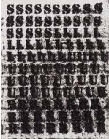
Glenn Ligon Study for Impediment , 2007 Oil stick and coal dust on paper 9 x 11 3/4 in.