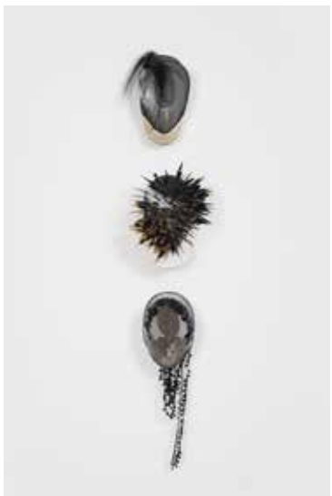
Allison Janae Hamilton Janae Untitled (Three Fencing Masks) , 2017 Found vintage fencing masks, painted feathers, horse hair, velvet, cotton trimming, acrylic paint