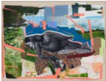
Mickalene Thomas Sleep: Deux Femmes Noires , 2011 Mixed media collage paper, 23 ¾ x 31 ¼ in.