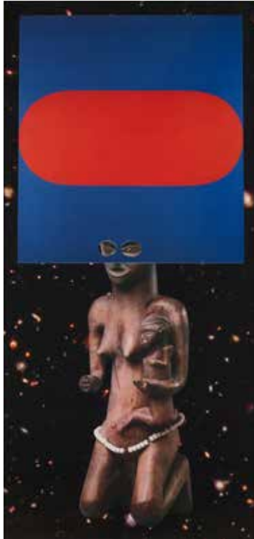
William Villalongo Sista Ancestra , 2012 Archival Pigment Print Sheet: 70 x 35 in.