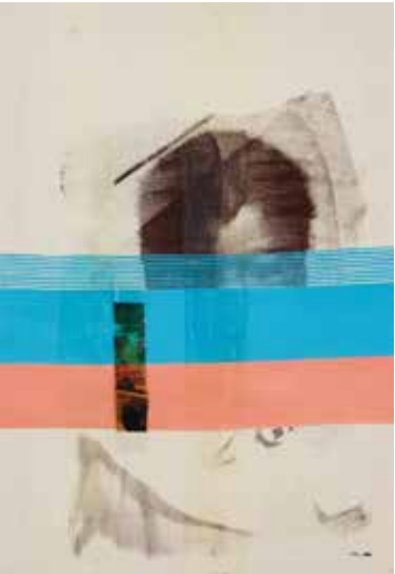
Tomashi Jackson Magnet School 1 , 2014 Acrylic and silk screen on canvas 36 x 25 1/8 in.