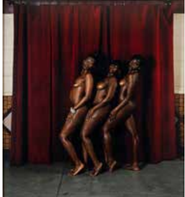
Deana Lawson Three Women , 2013 Pigment Print 35 x 45 in.