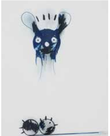
Nayland Blake 4.3.15, 2015 Colored Pencil on Paper, 12 x 9 in.