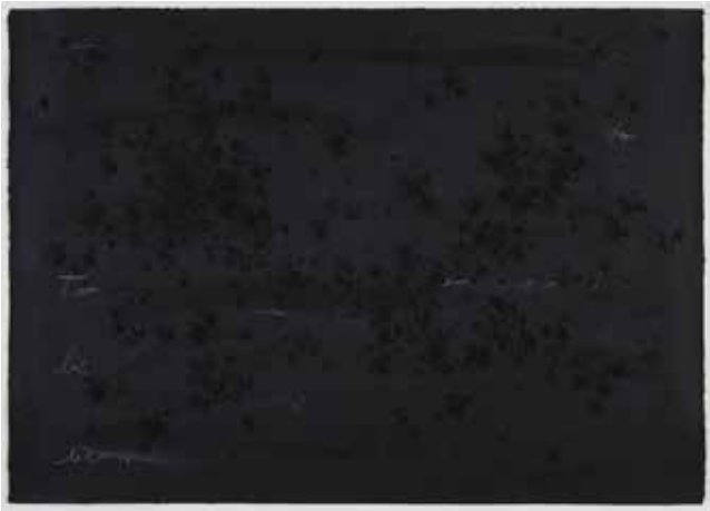
Bethany Collins, Too White To Be Black , 2014. © Bethany Collins, courtesy Patron Gallery, Chicago

perceived racial barriers. These works display a spectrum of approaches to portraiture that includes direct figurative representation, works that question histories of mis- and underrepresentation, and those that expand notions of what constitutes a portrait.