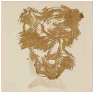
Lorna Simpson Gold Head #1 , 2011 Ink and embossing powder on paper 11 x 8 ½ in.