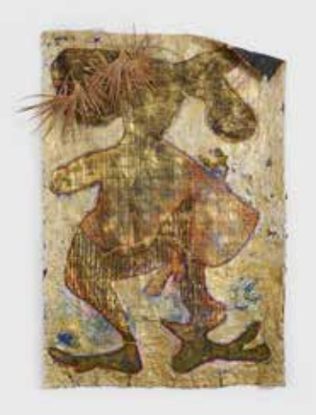
Angie Jennings Goldie , 2015 Acrylic, latex, tempera, spray paint, compost yarn on quilt, 82 x 56 in.