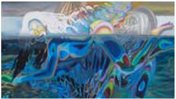
Caitlin Cherry Ghost Leviathan , 2018 Oil on canvas, 57 x 101 in.