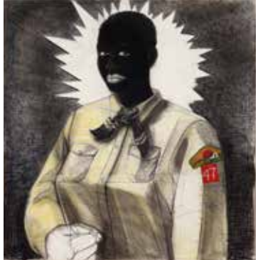
Kerry James Marshall James Den Mother , 1996 Acrylic on charcoal on paper