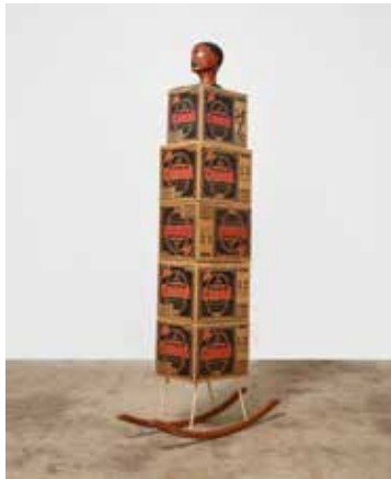
Henry Taylor Rock It , 2008 5 cardboard boxes (premium malt boxes), acrylic on foam mannequin head, wood) 36 x 12 x 80 ½ in.