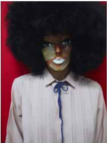
Narcissister Untitled , 2012 c-print, 40 x 30 in.