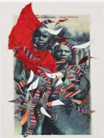
Kenyatta A.C. Hinkle A Strong Wind , 2014 Collage, India Ink, and Acrylic Paint on transparency, 8 ½ x 11 in.