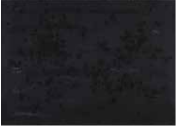
Bethany Collins Too White To Be Black , 2014 Graphite, charcoal, and latex paint on Arches paper 29 x 41 in.