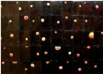
Nari Ward At any time prior to no later than , 2009 Stencil ink and basketball cards on paper, 24 ½ x 32 in.