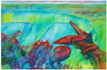
Cy Gavin Reef , 2018 Acrylic, chalk and oil on denim 56 x 85 in.