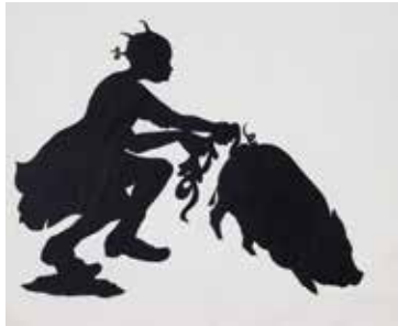
Kara Walker Untitled , 1995, Paper collage on paper, 52 x 60 ¾ in.