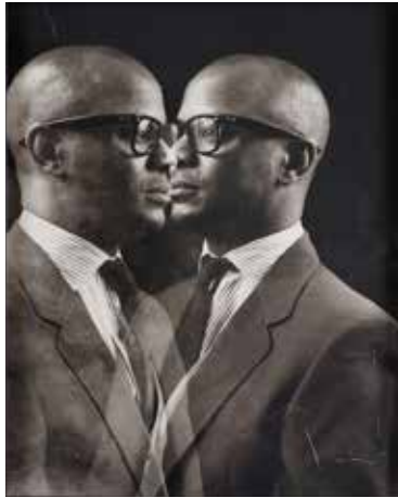
Rashid Johnson The New Negro Escapist Social and Athletic Club "The Kiss," 2010 Silver gelatin print 10 x 8 in.