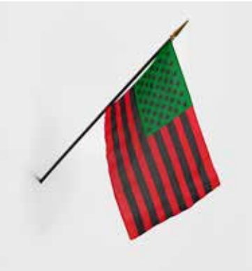
David Hammons African-American Flag , 2011 Printed fabric with painted wood pole 19 ½ x 12 ½ in.