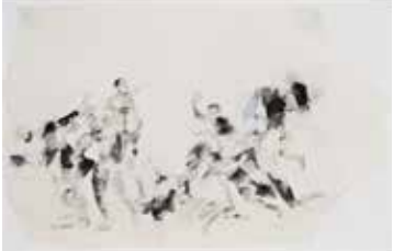
Wardell Milan Desire and the Black Masseur , 2005 Mixed media on paper 63 ½ x 40 ½ in.