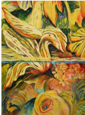
Vaughn Spann Radiant Sunshine, The Morning After (For Lula) , 2017 Oil and acrylic on paper 103 x 80 in.