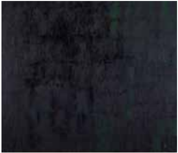
Alteronce Gumby Gumby Nation , 2014 Plastilina and oil bar on canvas 60 x 70 in.