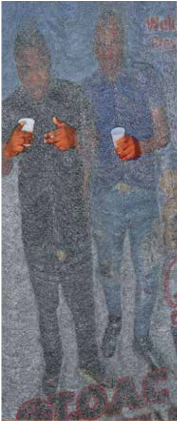
Wilmer Wilson IV Pres , 2017 Staples and pigment print on wood 96 x 48 x 1 ½ in.