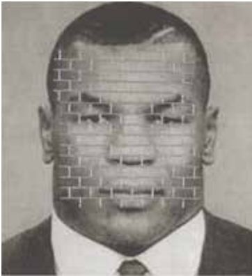
Derrick Adams The Great Wall , 2009 Digital photograph and metallic paint 25 × 22 in.